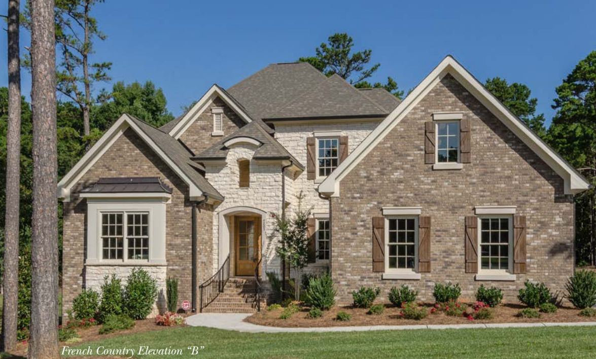
French Country Elevation "B"